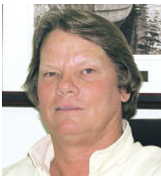
Moses Kirkconnell MLA for Sister Islands