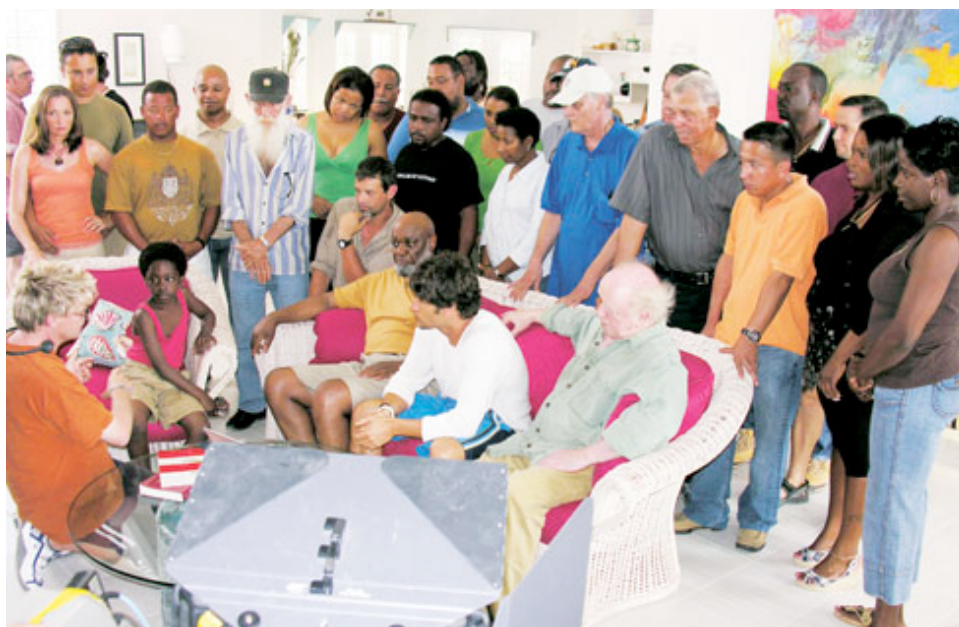
One of the final scenes in "Cayman Went"

The cast and crew of the independent movie "Cayman Went" are getting ready to leave Cayman Brac at the end of this week, but they will leave behind an island that has been buzzing with the excitement of being a part of the movie business for the past two weeks.